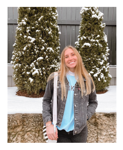
Public Relations Chairman