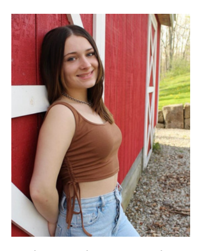
Diversity Equity and Inclusion