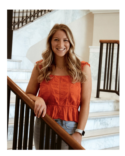
VP of Academic Excellence