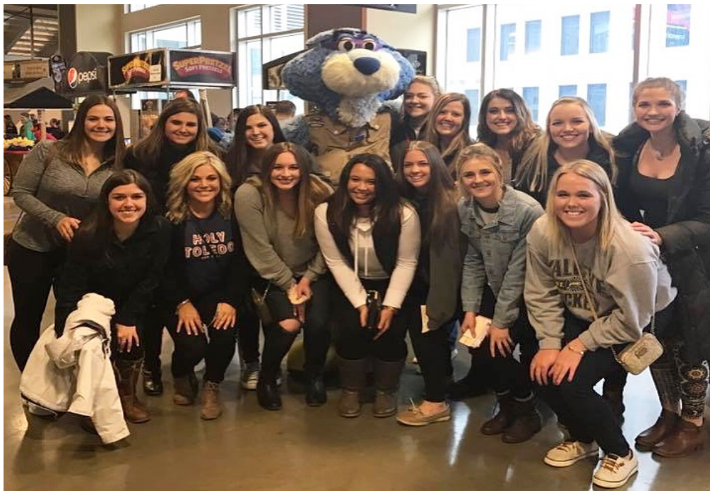
Senior Programming at Toledo Walleye Game!